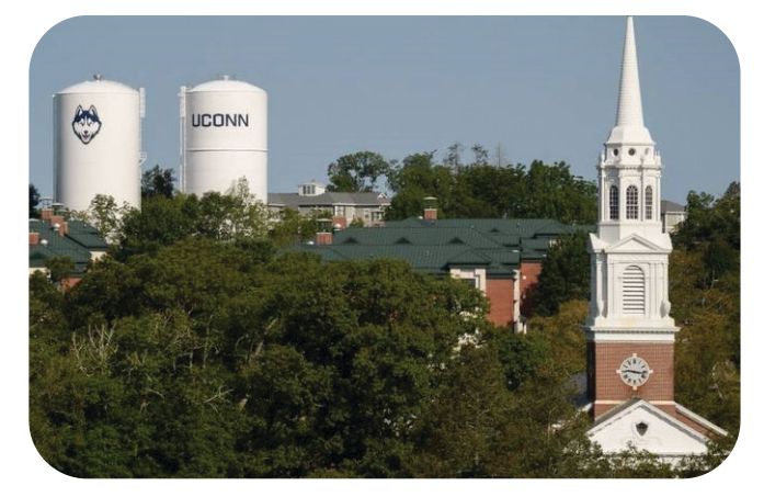
University Water Towers

A Water System Advisory Group with representatives from the Town of Mansfield, UConn, nearby communities, and other stakeholders, meets regularly to review local projects and ensure communication and collaboration relating to CWC's system and requests for water service in the area. The group also makes recommendations about best management practices, including water conservation programs, and the company works with the Advisory Group to implement such programs.